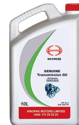
Hino Genuine Transmission Oil