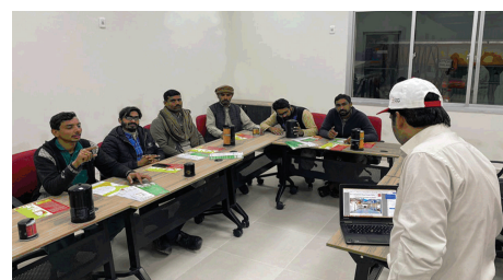
Training Center for Customers