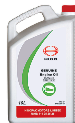
Hino Genuine Engine Oil

Hino Genuine Oil is designed and formulated to meet the severe technical constraints of the turbocharged and naturally aspirated modern and older diesel engines / differential / transmission.