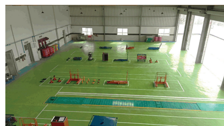
Fully Equipped Hino Standard Workshop