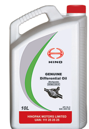
Hino Genuine Differential Oil