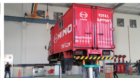
Two Post Lift