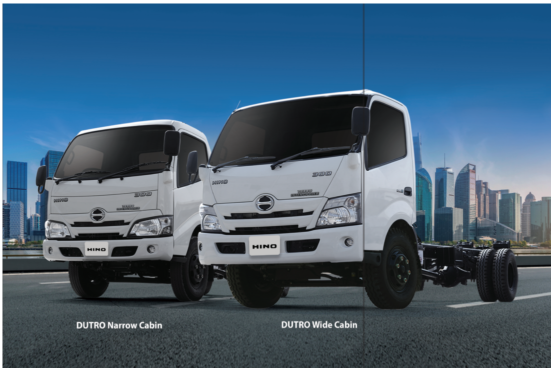
DUTRO Narrow Cabin