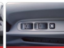
POWER DOOR & WINDOW

Intuitively and spaciouly designed the Hino 300 Series cab space has factoryfitted air conditioner & heater for more driving comfort.