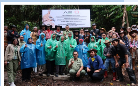
Partnering with a local safari park to conduct preservation activities for the Javan hawk-eagle

After joining the company, I was assigned a position that supports the legal department, and in August 2010 was selected to be a member of the HMSI CSR Committee. I feel a great deal of satisfaction with the endeavors of this committee, which promotes over 100 different CSR activities such as environmental conservation, health promotion, support for human resources creation, support for local culture, and support for recovery after a natural disaster.