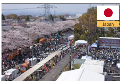
A SAKURA festival open to local residents