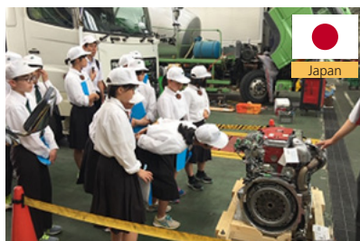
A company tour for local middle school students