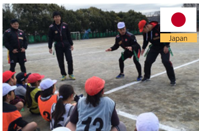
Tag rugby classroom for local elementary school students