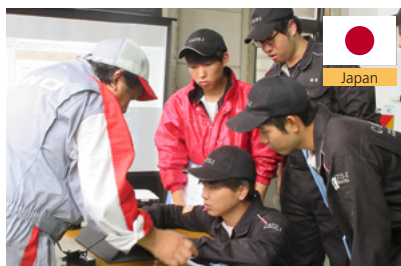
Technical workshops for local technical students