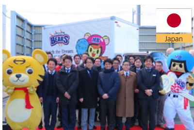
Supporting activities of a local baseball team called Saitama Musashi Heat Bears