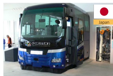
Exhibiting a real cut bus at the Science Hills Komatsu local science museum