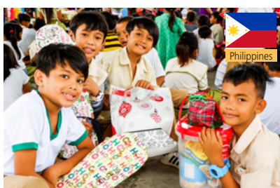
Donating toys to local children