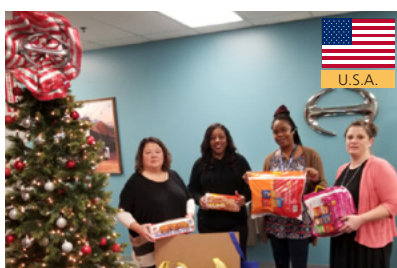
Donating Christmas gift to local children of poor families