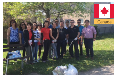
Community cleaning (Hino Motors Canada, Ltd.)