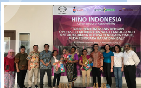
Offering free cleft lip/cleft palate surgeries