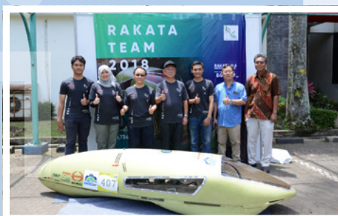
Supporting renewable energy development