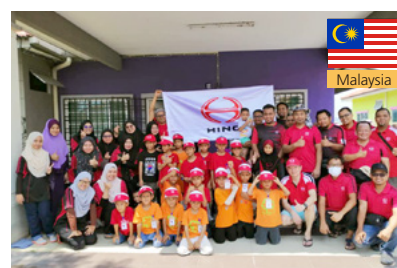
Donating food and stationery to the local orphanage and repair facilities