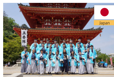
SHINSENGUMI FESTIVAL HINO CITY, TOKYO