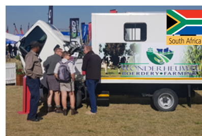
Exhibiting a full lineup at the South African Agricultural Trade Show (NAMPO); (Hino distributor: Toyota South Africa)