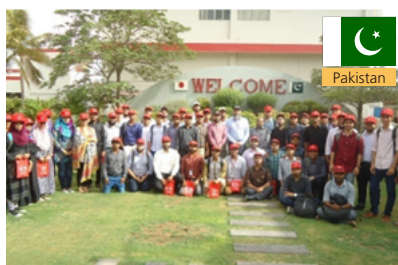
Accepting internship students to provide a practical learning environment for university students