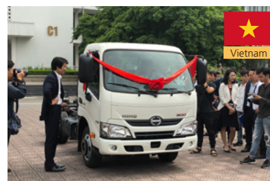
Donating trucks for regional university