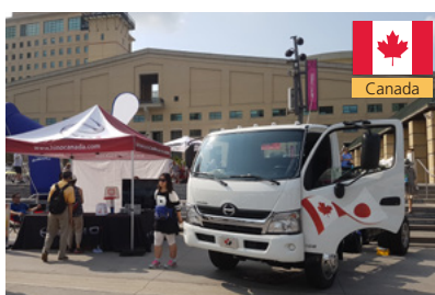
Introducing product safety and environmental technologies at a local JAPAN FESTIVAL (Hino Motors Canada, Ltd.)