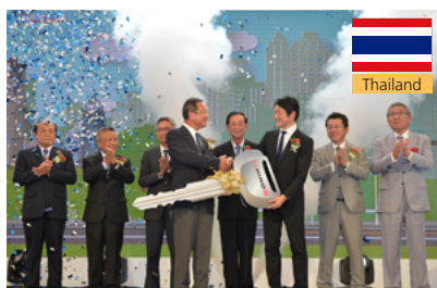
Donating Hino Hybrid Bus to Bangkok Mass Transit Authority (BMTA) for technology diffusion