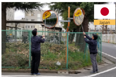
Cleaning traffic mirrors in the community (Sankyo Radiator Co., Ltd.)